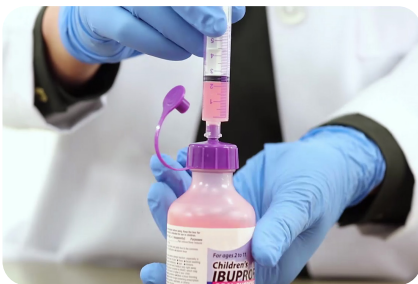
Virtual presentations and product demonstrations

Avanos can support your ENFit® transition remotely with our exclusive Virtual Go Live Program . Our ENFit® experts will virtually walk you through each step of your conversion to ensure a smooth ENFit® transition.